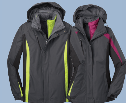
PORT AUTHORITY® Colorblock 3-in-1 Jacket J321 XS-4XL $99.98 Ladies Colorblock 3-in-1 Jacket L321 XS-4XL $99.98