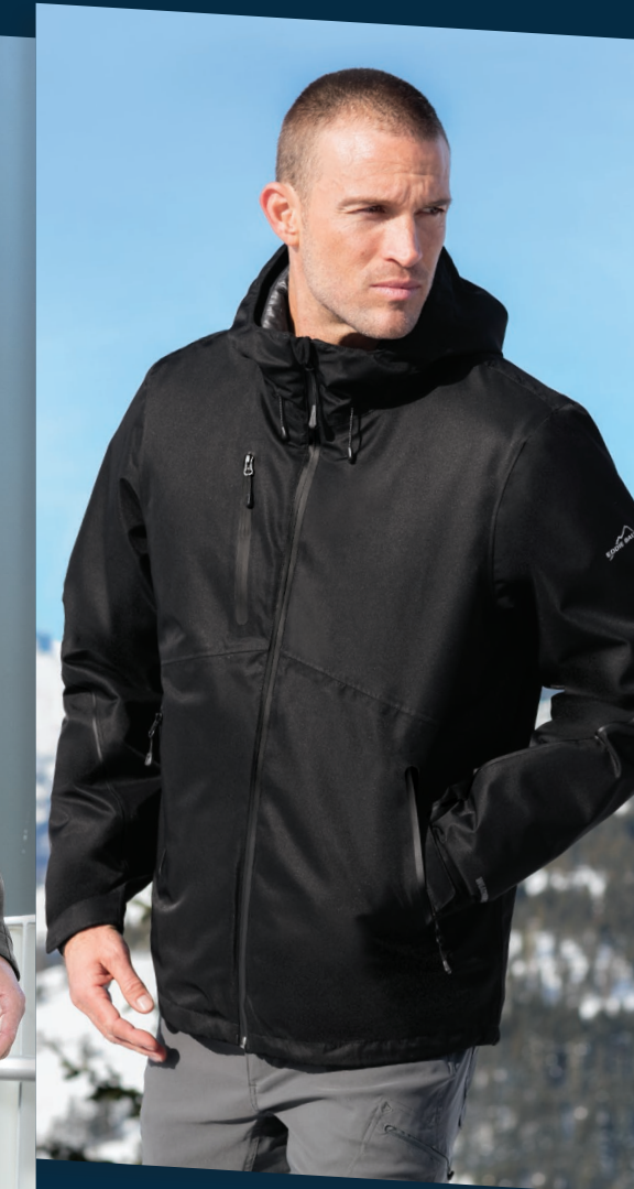
SHELLS & 3-IN-1s