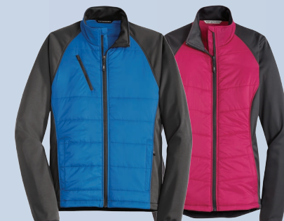
PORT AUTHORITY® Hybrid Soft Shell Jacket J787 XS-4XL $59.98 Ladies Hybrid Soft Shell Jacket L787 XS-4XL $59.98