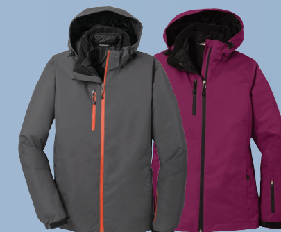
PORT AUTHORITY® Vortex Waterproof 3-in-1 Jacket J332 XS-4XL $119.98 Ladies Vortex Waterproof 3-in-1 Jacket L332 XS-4XL $119.98