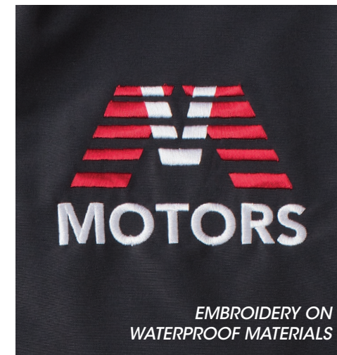
EMBROIDERY ON WATERPROOF MATERIALS