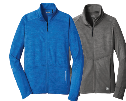
OGIO® ENDURANCE Sonar Full-Zip OE702 XS-4XL $63.98 Ladies Sonar Full-Zip LOE702 XS-4XL $63.98