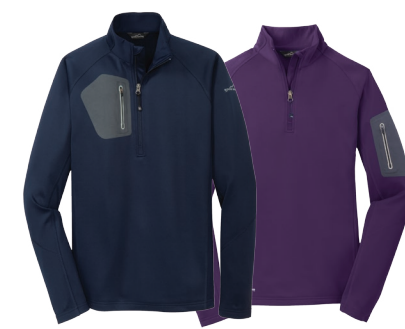
EDDIE BAUER® 1/2-Zip Performance Fleece EB234 XS-4XL $59.98 Ladies 1/2-Zip Performance Fleece EB235 XS-4XL $59.98