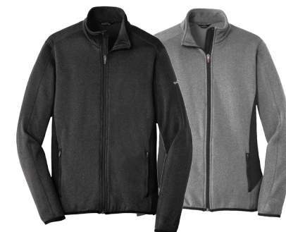
EDDIE BAUER® Full-Zip Heather Stretch Fleece Jacket EB238 XS-4XL $59.98 Ladies Full-Zip Heather Stretch Fleece Jacket EB239 XS-4XL $59.98