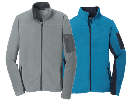
PORT AUTHORITY® Summit Fleece Full-Zip Jacket F233 XS-4XL $39.98 Ladies Summit Fleece Full-Zip Jacket L233 XS-4XL $39.98