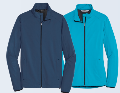
PORT AUTHORITY® Core Soft Shell Jacket J717 XS-4XL $35.98 Ladies Active Soft Shell Jacket L717 XS-4XL $35.98

Resist rain and wind with our soft shells