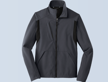
PORT AUTHORITY® Back-Block Soft Shell Jacket J336 XS-4XL $49.98