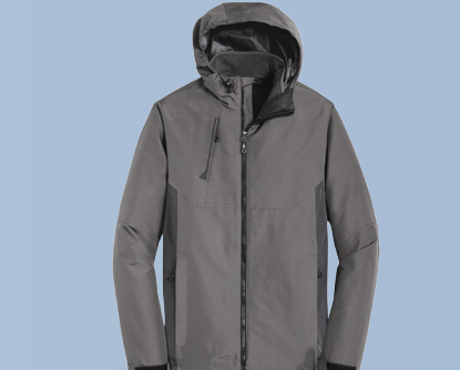
PORT AUTHORITY® Merge 3-in-1 Jacket J338 XS-4XL $89.98