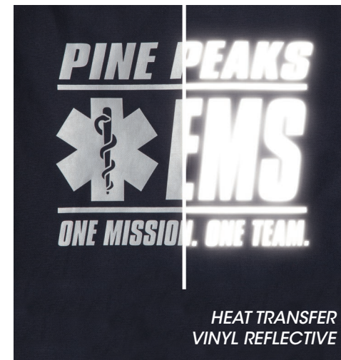
HEAT TRANSFER VINYL REFLECTIVE