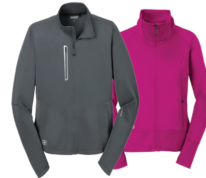
OGIO® ENDURANCE Fulcrum Full-Zip OE700 XS-4XL $59.98 Ladies Fulcrum Full-Zip LOE700 XS-4XL $59.98