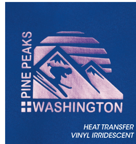
HEAT TRANSFER VINYL IRRIDESCENT