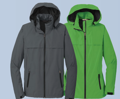
PORT AUTHORITY® Torrent Waterproof Jacket J333 XS-4XL $49.98 Ladies Torrent Waterproof Jacket L333 XS-4XL $49.98

Fight the elements with 3-in-1s and powerhouse shells