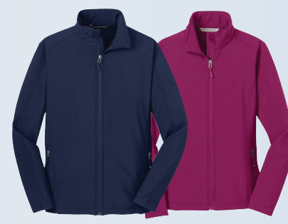
PORT AUTHORITY® Core Soft Shell Jacket J317 XS-6XL $39.98† Ladies Core Soft Shell Jacket L317 XS-4XL $39.98†