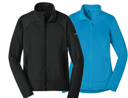
EDDIE BAUER® Highpoint Fleece Jacket EB240 XS-4XL $65.98 Ladies Highpoint Fleece Jacket EB241 XS-4XL $65.98