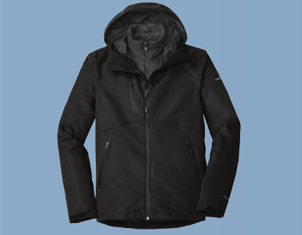
EDDIE BAUER® WeatherEdge® Plus 3-in-1 Jacket EB556 XS-4XL $239.98