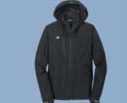
OGIO® ENDURANCE Impact Jacket OE750 XS-4XL $199.98