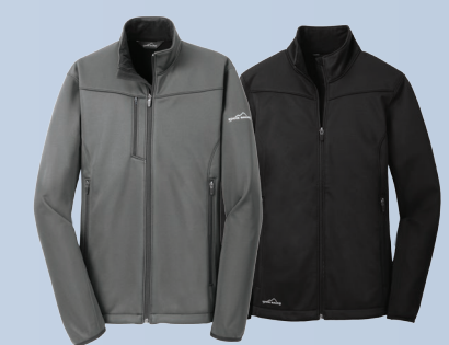
EDDIE BAUER® Weather-Resist Soft Shell Jacket EB538 XS-4XL $69.98 Ladies Weather-Resist Soft Shell Jacket EB539 XS-4XL $69.98