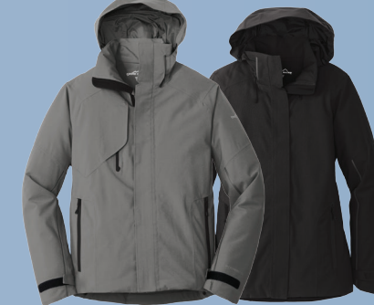
EDDIE BAUER® WeatherEdge® Plus Insulated Jacket EB554 XS-4XL $139.98 Ladies WeatherEdge® Plus Insulated Jacket EB555 XS-4XL $139.98