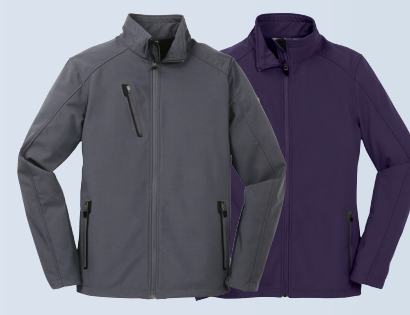
PORT AUTHORITY® Welded Soft Shell Jacket J324 XS-4XL $49.98 Ladies Welded Soft Shell Jacket L324 XS-4XL $49.98