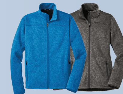
EDDIE BAUER® StormRepeL® Soft Shell Jacket EB540 XS-4XL $69.98 Ladies StormRepeL® Soft Shell Jacket EB541 XS-4XL $69.98