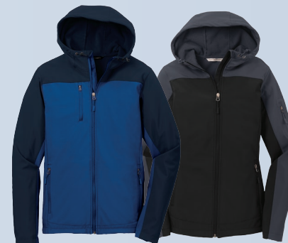
PORT AUTHORITY® Hooded Core Soft Shell Jacket J335 XS-4XL $53.98 Ladies Hooded Core Soft Shell Jacket L335 XS-4XL $53.98