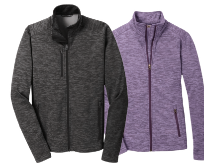
PORT AUTHORITY® Digi Stripe Fleece Jacket F231 XS-4XL $49.98 Ladies Digi Stripe Fleece Jacket L231 XS-4XL $49.98