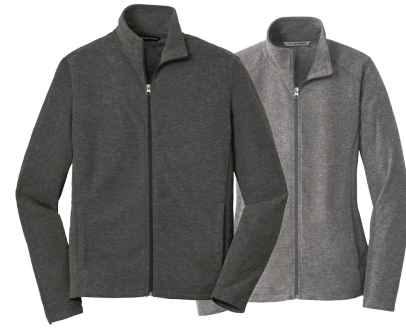
PORT AUTHORITY® Heather Microfleece Full-Zip Jacket F235 XS-4XL $29.98 Ladies Heather Microfleece Full-Zip Jacket L235 XS-4XL $29.98

Layer on fleece and microfleece to add a warm touch