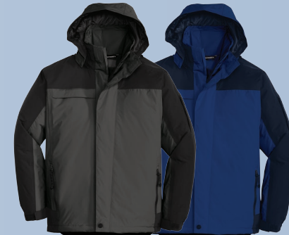
PORT AUTHORITY® Nootka Jacket J792 XS-4XL $89.98 Ladies Nootka Jacket L792 XS-4XL $89.98