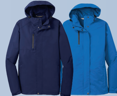
PORT AUTHORITY® All-Conditions Jacket J331 XS-4XL $59.98 Ladies All-Conditions Jacket L331 XS-4XL $59.98