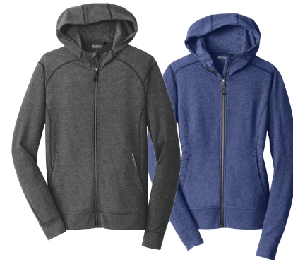
OGIO® ENDURANCE Cadmium Jacket OE502 XS-4XL $59.98 Ladies Cadmium Jacket LOE502 XS-4XL $59.98