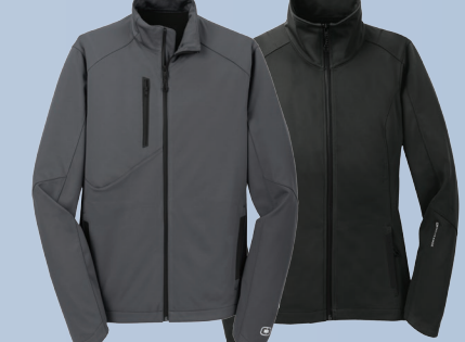
OGIO® ENDURANCE Crux Soft Shell OE720 XS-4XL $79.98 Ladies Crux Soft Shell LOE720 XS-4XL $79.98